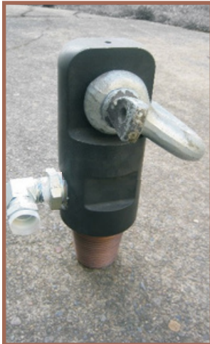
Side Air Inlet Shackle

Prevent bearing damage by hanging the hammer or use a crane.