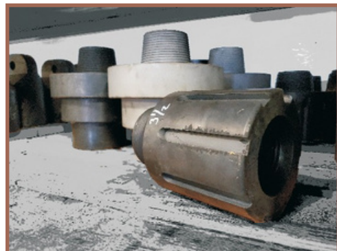
Weldable Pulling Plugs

Various subs, normal and reverse thread, various tapers.