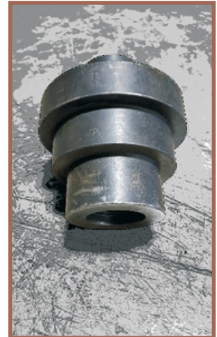
Multi-size weldable pulling plugs

Swivel allows casing to be pulled away as Top head lowers