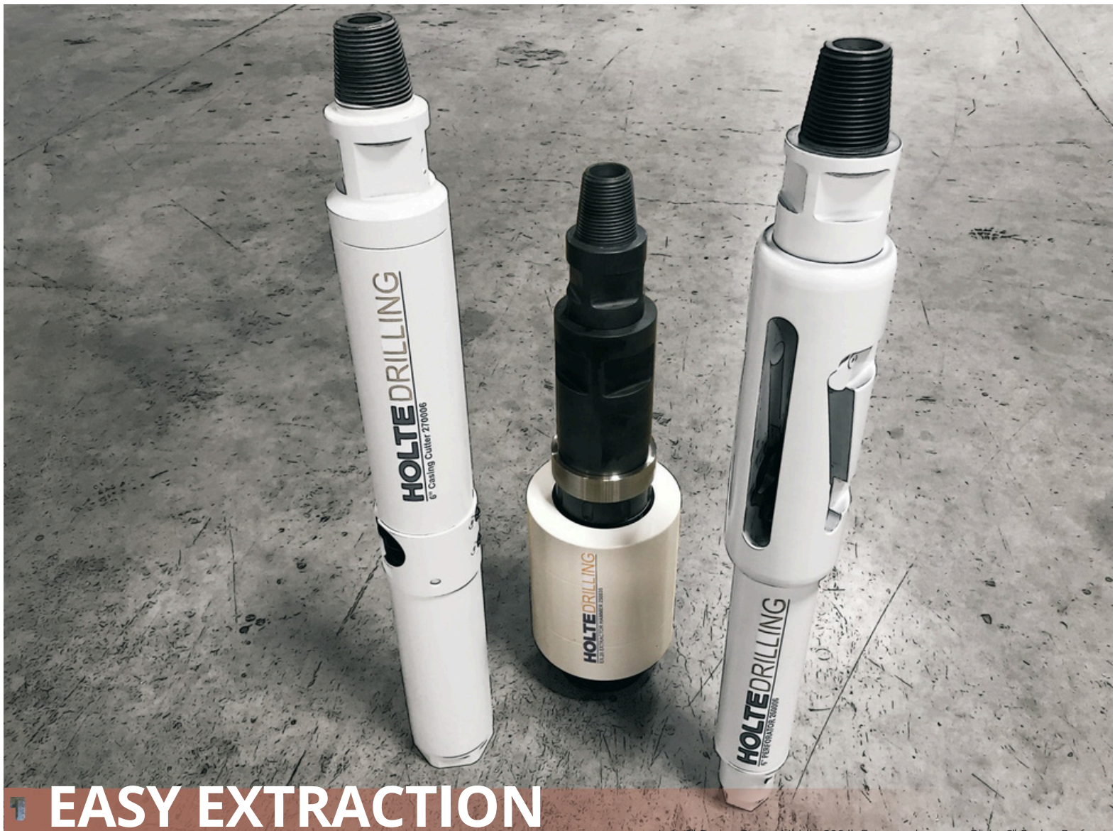
Left: 6" Casing Cutter, Middle: 200 lb Extractor hammer, Right: 6" Casing Perforator